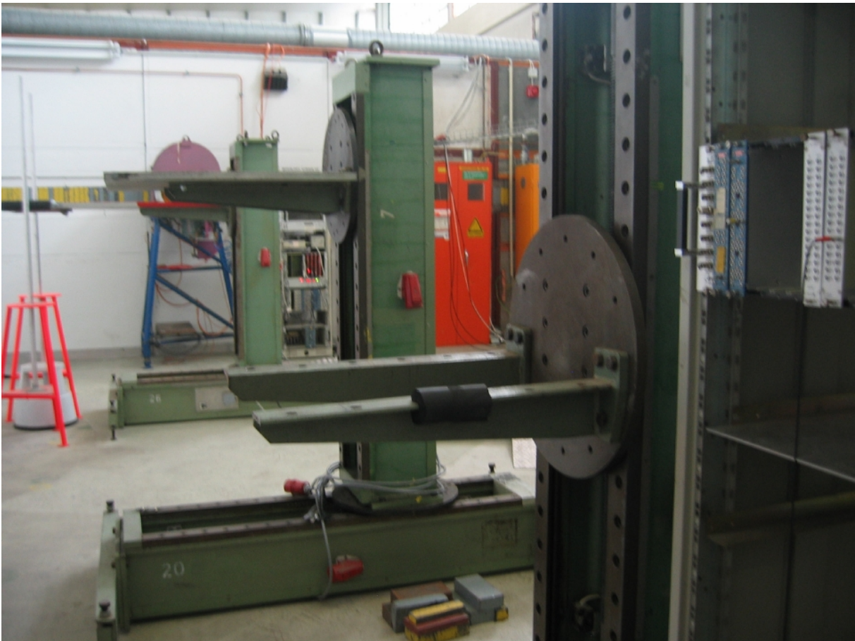
Fig.2: Big support without a plate