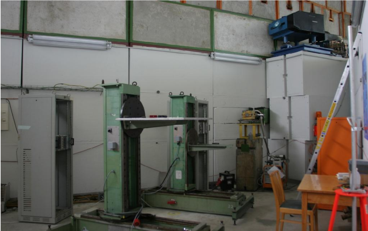
Fig.1: Big supports