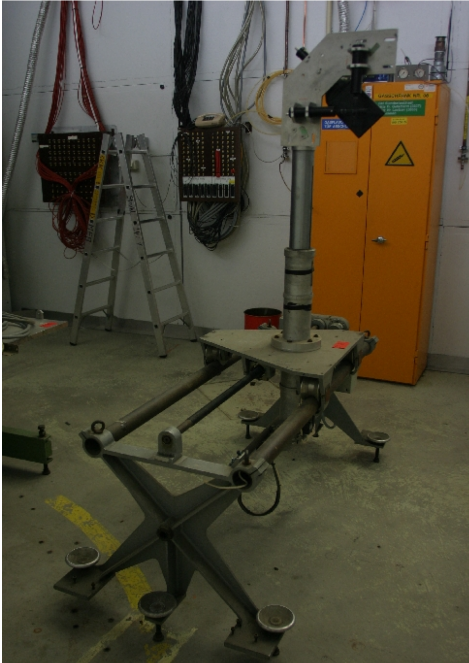
Fig.5: Small support