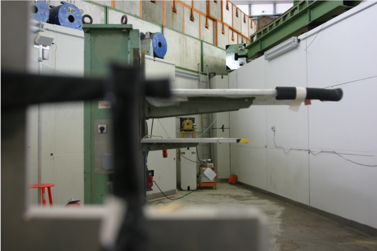
Fig.3: (1000kg stage) Testbeam, trigger unit & big supports